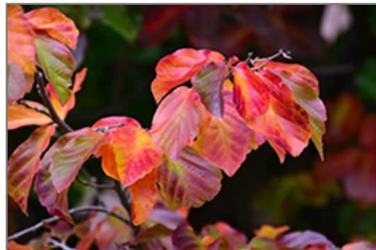
Persian Parrotia in fall