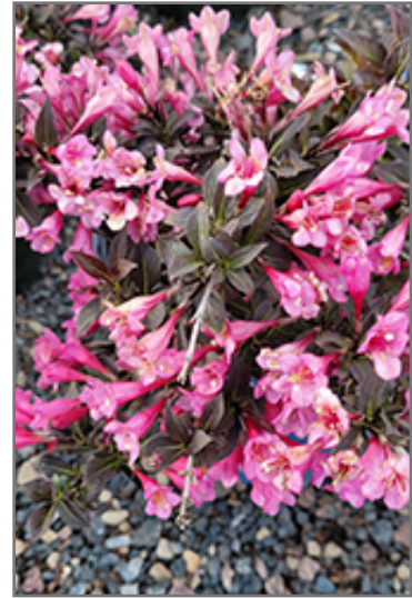
Date Night Stunner Weigela flowers