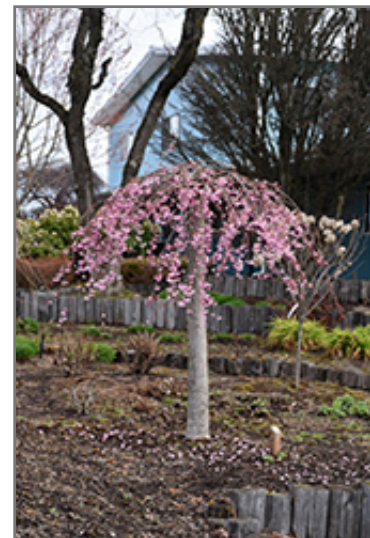
Pink Cascade Weeping Cherry in bloom