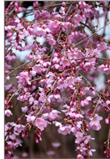
Pink Cascade Weeping Cherry flowers