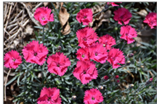
Paint The Town Magenta Pinks flowers