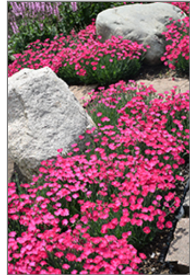
Paint The Town Magenta Pinks in bloom

Paint The Town Magenta Pinks is an herbaceous evergreen perennial with a mounded form. It brings an extremely fine and delicate texture to the garden composition and should be used to full effect.