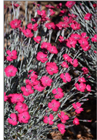
Wicked Witch Pinks flowers

Wicked Witch Pinks is a fine choice for the garden, but it is also a good selection for planting in outdoor pots and containers. It is often used as a 'filler' in the 'spiller-thriller-filler' container combination, providing a mass of flowers and foliage against which the thriller plants stand out. Note that when growing plants in outdoor containers and baskets, they may require more frequent waterings than they would in the yard or garden.