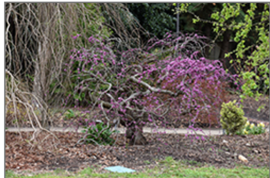
Traveller Weeping Redbud in bloom