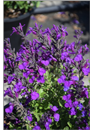
Mirage Deep Purple Autumn Sage flowers

This is a relatively low maintenance plant, and should only be pruned after flowering to avoid removing any of the current season's flowers. It is a good choice for attracting bees, butterflies and hummingbirds to your yard, but is not particularly attractive to deer who tend to leave it alone in favor of tastier treats. It has no significant negative characteristics.