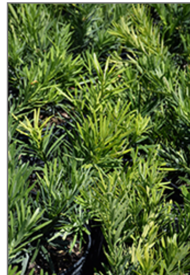
Pringle's Dwarf Shrubby Podocarpus foliage