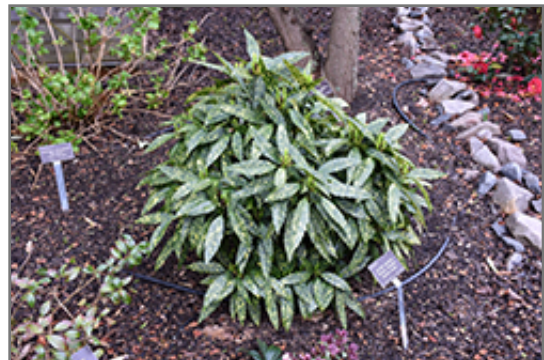
Hosoba Hoshifu Aucuba