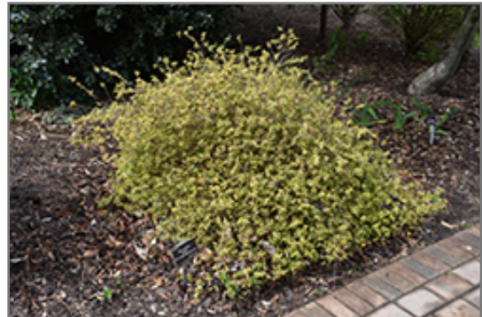
Twist of Orange Glossy Abelia