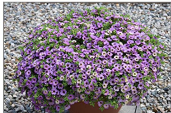
Chameleon Plum Cobbler Calibrachoa in bloom