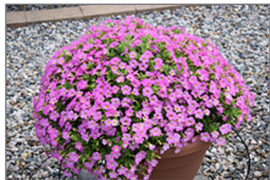
Chameleon Pink Passion Calibrachoa in bloom