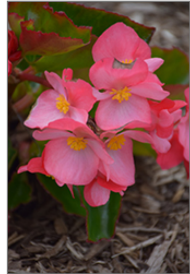
Megawatt Rose Green Leaf Begonia flowers

Megawatt Rose Green Leaf Begonia is an herbaceous annual with an upright spreading habit of growth. Its medium texture blends into the garden, but can always be balanced by a couple of finer or coarser plants for an effective composition.