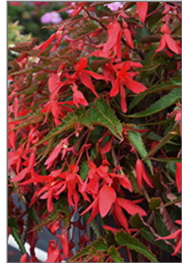
Waterfall Encanto Pink Begonia flowers

Waterfall Encanto Pink Begonia is an herbaceous evergreen perennial with a trailing habit of growth, eventually spilling over the edges of hanging baskets and containers. Its medium texture blends into the garden, but can always be balanced by a couple of finer or coarser plants for an effective composition.