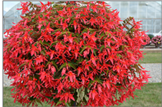
Waterfall Encanto Pink Begonia in bloom

Waterfall Encanto Pink Begonia is a fine choice for the garden, but it is also a good selection for planting in outdoor containers and hanging baskets. Because of its trailing habit of growth, it is ideally suited for use as a 'spiller' in the 'spiller-thriller-filler' container combination; plant it near the edges where it can spill gracefully over the pot. Note that when growing plants in outdoor containers and baskets, they may require more frequent waterings than they would in the yard or garden.