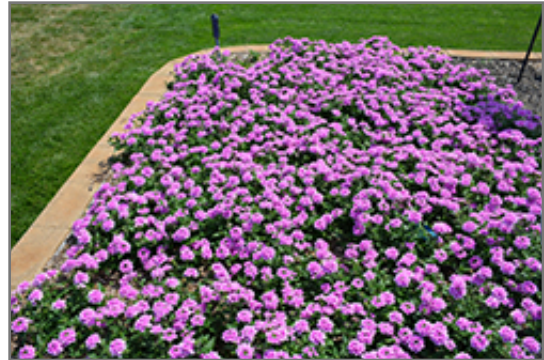
EnduraScape Pink Bicolor Verbena in bloom