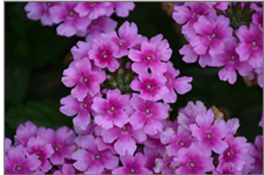
EnduraScape Pink Bicolor Verbena flowers

EnduraScape Pink Bicolor Verbena is an herbaceous perennial with a trailing habit of growth, eventually spilling over the edges of hanging baskets and containers. It brings an extremely fine and delicate texture to the garden composition and should be used to full effect.