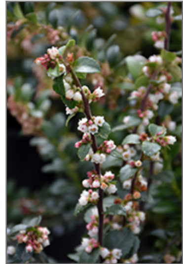
Thunderbird Evergreen Huckleberry flowers