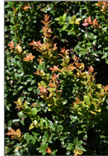
Thunderbird Evergreen Huckleberry foliage

Thunderbird Evergreen Huckleberry makes a fine choice for the outdoor landscape, but it is also well-suited for use in outdoor pots and containers. With its upright habit of growth, it is best suited for use as a 'thriller' in the 'spiller-thriller-filler' container combination; plant it near the center of the pot, surrounded by smaller plants and those that spill over the edges. It is even sizeable enough that it can be grown alone in a suitable container. Note that when grown in a container, it may not perform exactly as indicated on the tag - this is to be expected. Also note that when growing plants in outdoor containers and baskets, they may require more frequent waterings than they would in the yard or garden.