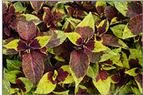
Premium Sun Pineapple Surprise Coleus foliage

Premium Sun Pineapple Surprise Coleus is recommended for the following landscape applications;