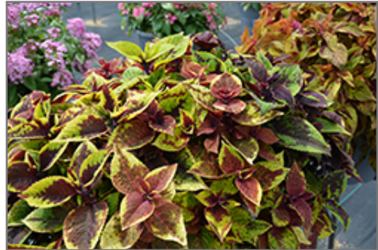
Premium Sun Pineapple Surprise Coleus

Premium Sun Pineapple Surprise Coleus will grow to be about 24 inches tall at maturity, with a spread of 20 inches. When grown in masses or used as a bedding plant, individual plants should be spaced approximately 18 inches apart. Although it's not a true annual, this fast-growing plant can be expected to behave as an annual in our climate if left outdoors over the winter, usually needing replacement the following year. As such, gardeners should take into consideration that it will perform differently than it would in its native habitat.