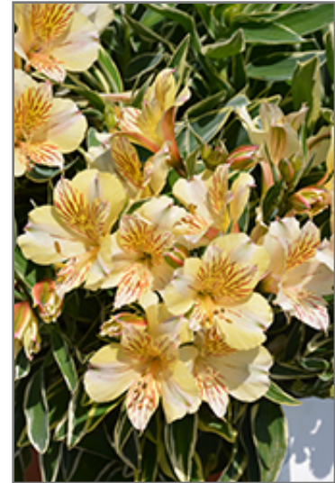
Colorita Fabiana Alstroemeria flowers

Colorita Fabiana Alstroemeria is recommended for the following landscape applications;