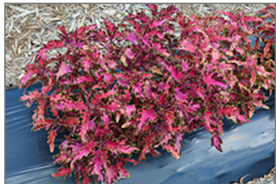
Under The Sea Pink Reef Coleus