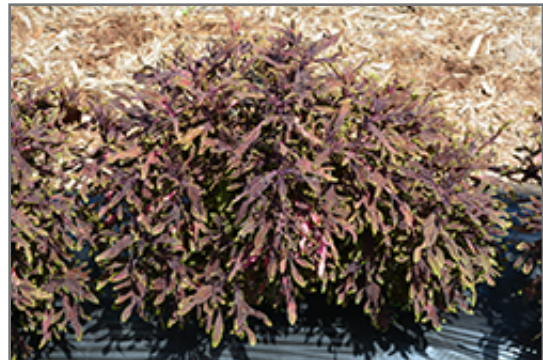
Under The Sea Lion Fish Coleus