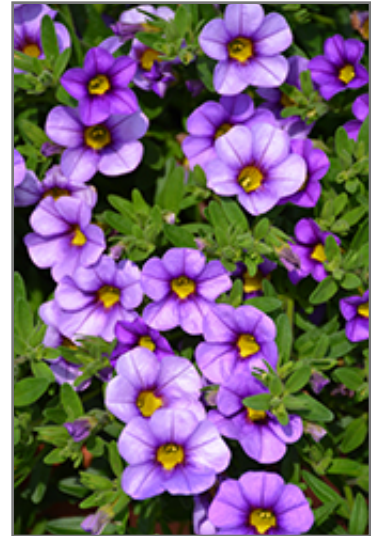
Kimono Blue Dragon Calibrachoa flowers

Kimono Blue Dragon Calibrachoa is recommended for the following landscape applications;