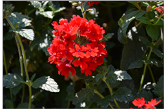
Superbena Royale Red Verbena flowers

This plant will require occasional maintenance and upkeep. Trim off the flower heads after they fade and die to encourage more blooms late into the season. Deer don't particularly care for this plant and will usually leave it alone in favor of tastier treats. It has no significant negative characteristics.