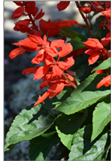
Ablazin' Tabasco Sage flowers

Ablazin' Tabasco Sage is recommended for the following landscape applications;