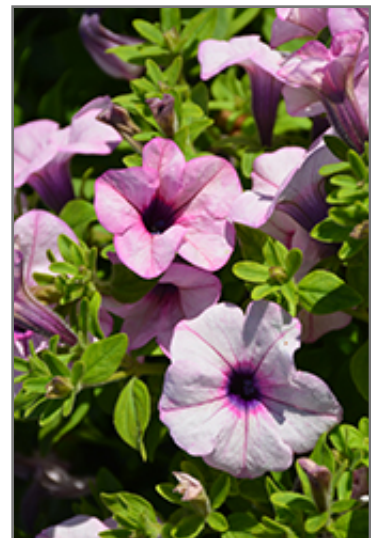
Surfinia Sumo Glacial Pink Petunia flowers