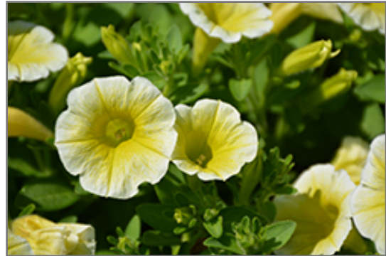
Blanket Yellow Petunia flowers

Blanket Yellow Petunia is recommended for the following landscape applications;