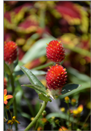
Forest Red Globe Amaranth flowers

Forest Red Globe Amaranth is recommended for the following landscape applications;