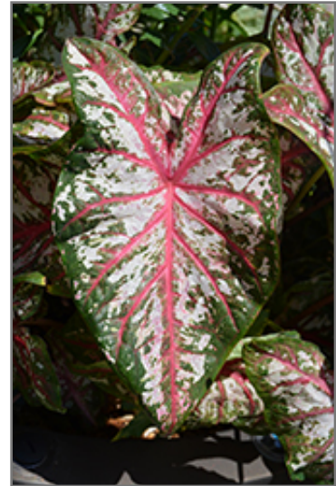
Artful Fire and Ice Caladium foliage