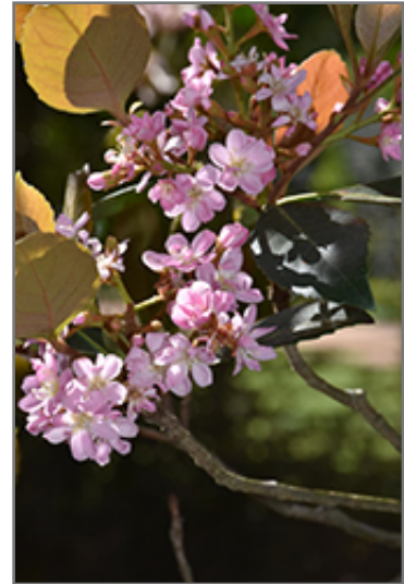
Rosalinda Indian Hawthorn flowers

Rosalinda Indian Hawthorn is recommended for the following landscape applications;