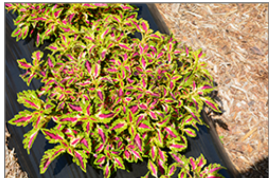
Terra Nova Jitters Coleus