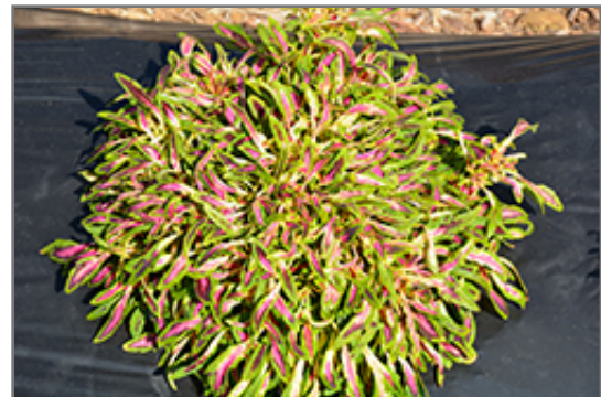
Fancy Feathers Pink Coleus