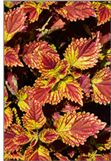
Color Clouds Be Mine Coleus foliage

Color Clouds Be Mine Coleus is recommended for the following landscape applications;