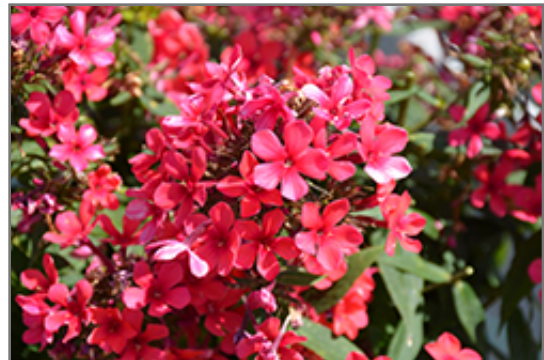
Early Red Garden Phlox flowers