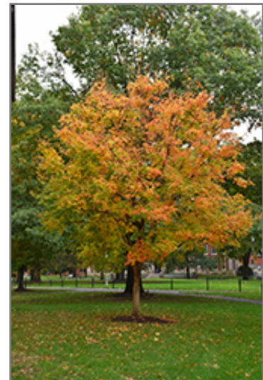
Three Flowered Maple in fall