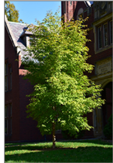
Three Flowered Maple