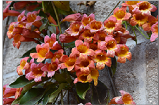
Tangerine Beauty Cross Vine flowers

This woody vine does best in full sun to partial shade. It is very adaptable to both dry and moist growing conditions, but will not tolerate any standing water. It is not particular as to soil type, but has a definite preference for acidic soils. It is highly tolerant of urban pollution and will even thrive in inner city environments. This is a selection of a native North American species.