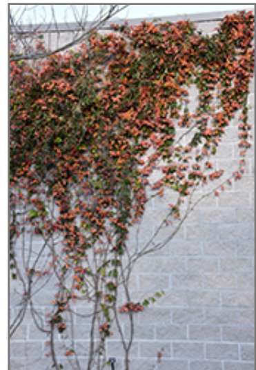
Tangerine Beauty Cross Vine in bloom