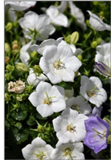
Rapido White Bellflower flowers