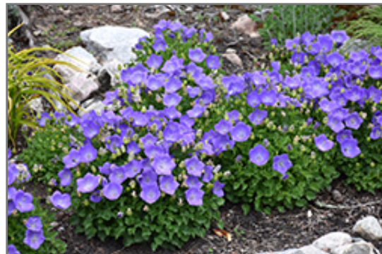
Rapido Blue Bellflower in bloom