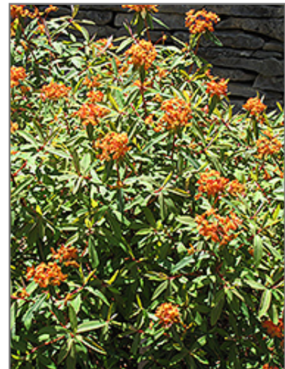
Fireglow Spurge in bloom