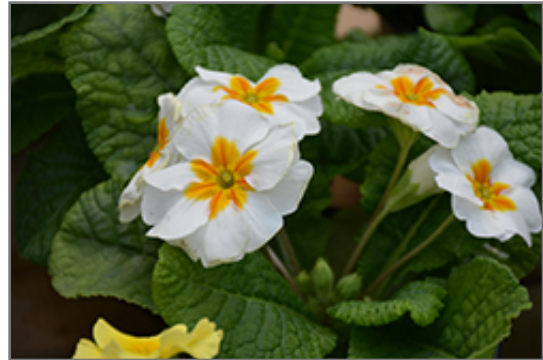
Lorien White Primrose flowers

When grown indoors, Lorien White Primrose can be expected to grow to be only 4 inches tall at maturity extending to 6 inches tall with the flowers, with a spread of 8 inches. It grows at a fast rate, and under ideal conditions can be expected to live for approximately 5 years. This houseplant performs well in both bright or indirect sunlight and strong artificial light, and can therefore be situated in almost any well-lit room or location. It requires an evenly moist well-drained soil for optimal growth, but will suffer if left to grow in standing water. The surface of the soil shouldn't be allowed to dry out completely, and so you should expect to water this plant once and possibly even twice each week. Be aware that your particular watering schedule may vary depending on its location in the room, the pot size, plant size and other conditions; if in doubt, ask one of our experts in the store for advice. It is not particular as to soil type or pH; an average potting soil should work just fine.