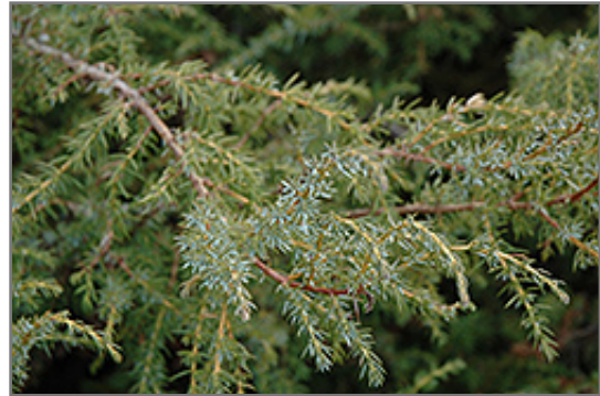
Common Juniper foliage