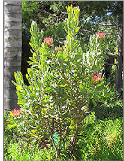
Sylvia Protea in bloom

This shrub should only be grown in full sunlight. It is very adaptable to both dry and moist growing conditions, but will not tolerate any standing water. It is not particular as to soil type, but has a definite preference for acidic soils. It is somewhat tolerant of urban pollution, and will benefit from being planted in a relatively sheltered location. Consider applying a thick mulch around the root zone in winter to protect it in exposed locations or colder microclimates. This particular variety is an interspecific hybrid.