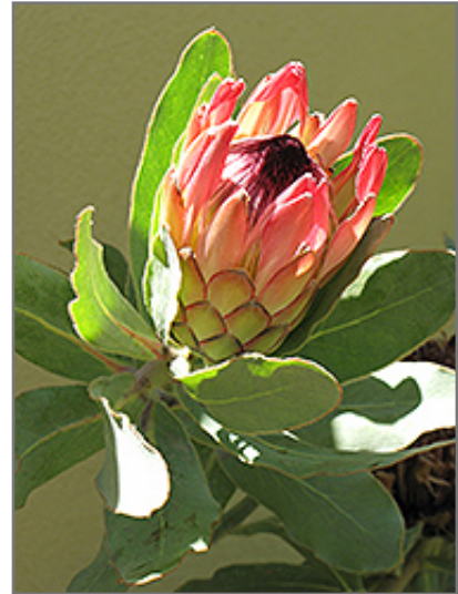
Sylvia Protea flowers