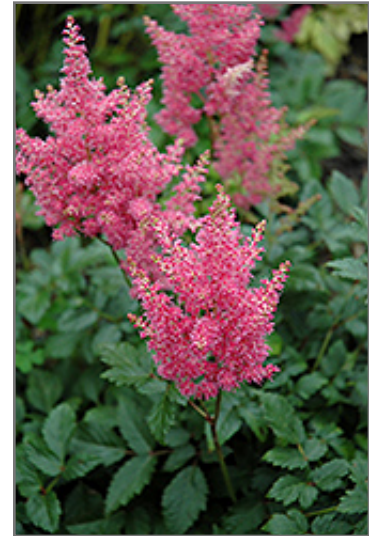
Rheinland Astilbe flowers

Rheinland Astilbe is recommended for the following landscape applications;