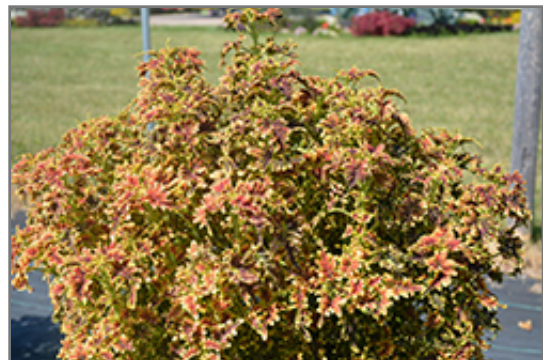
Under The Sea Copper Coral Coleus