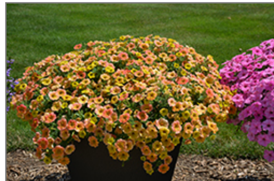
Supertunia Honey Petunia in bloom