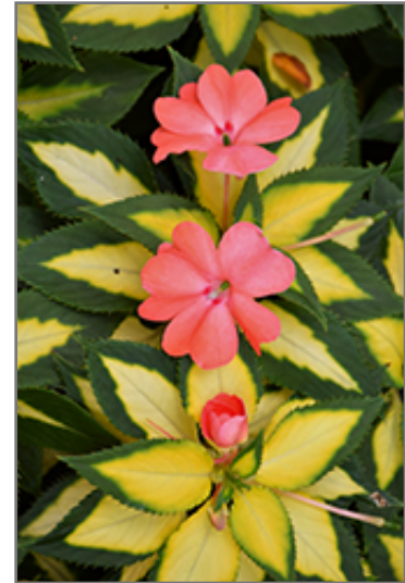
SunPatiens Spreading Salmon New Guinea Impatiens flowers

This plant will require occasional maintenance and upkeep, and should not require much pruning, except when necessary, such as to remove dieback. It is a good choice for attracting bees and butterflies to your yard. It has no significant negative characteristics.