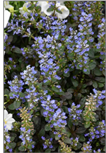
Chocolate Chip Bugleweed flowers

Chocolate Chip Bugleweed is recommended for the following landscape applications;