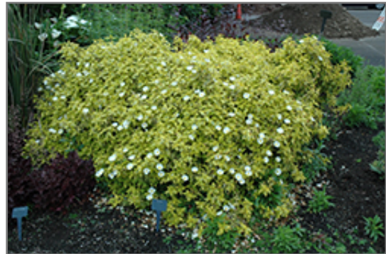
Mickie Rockrose in bloom