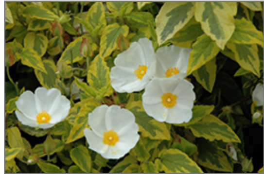
Mickie Rockrose flowers

Mickie Rockrose is recommended for the following landscape applications;