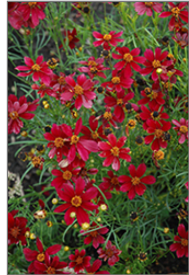
Red Satin Tickseed flowers