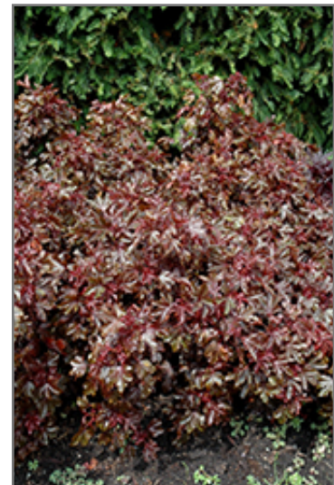
Little Zin Hibiscus