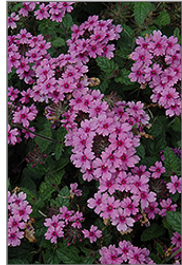
EnduraScape Lavender Verbena flowers

EnduraScape Lavender Verbena is recommended for the following landscape applications;