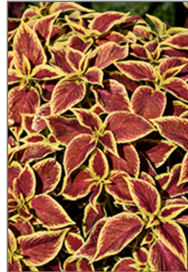
Premium Sun Crimson Gold Coleus foliage

Premium Sun Crimson Gold Coleus is recommended for the following landscape applications;